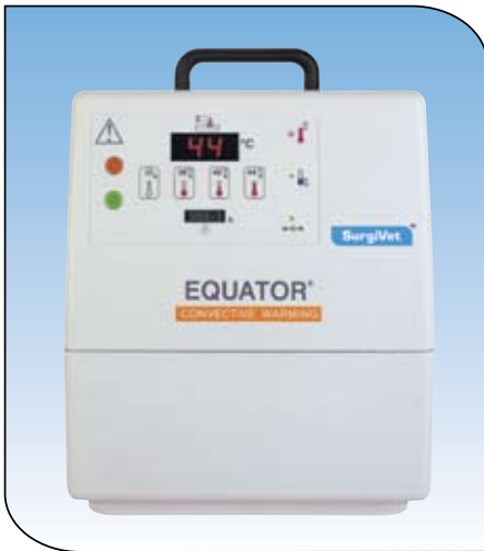
Catalog #: WWVEQ5000RS