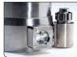
Easy viewing of liquid volume