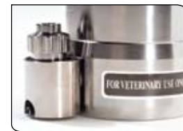
One piece fill assembly

SPECIFICATIONS SUBJECT TO CHANGE WITHOUT NOTICE Please read the Instructions for Use supplied with the product for detailed instructions, warnings, and cautions.